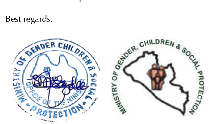
Williametta E. Saydee-Tarr Minister of Gender, Children and Social Protection